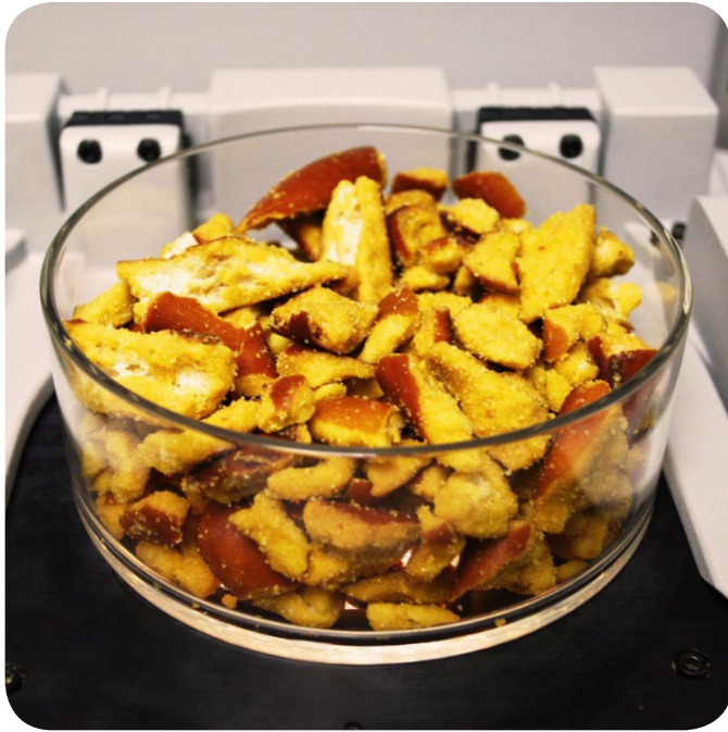
Figure 1. Glass sample cup with pretzel bites ready for color measurement on a HunterLab D25LT with a large 89 mm diameter area of sample view.