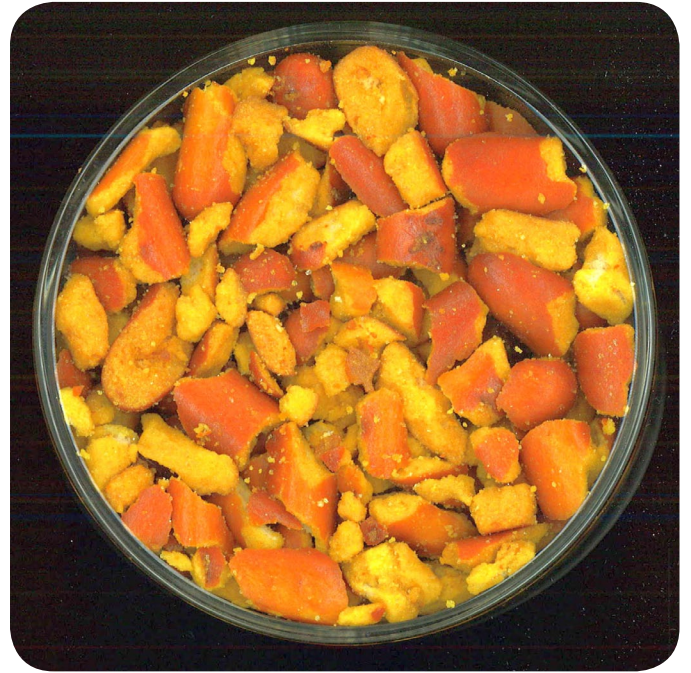
Figure 2. This is the instrument view through the bottom of the dish. The instrument optically averages all colors within the field of sample view.