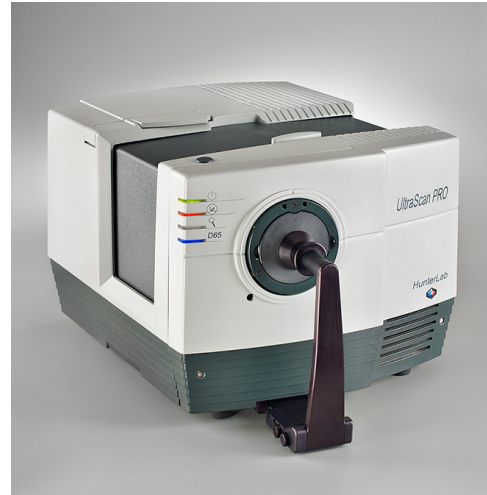
UltraScan ® PRO