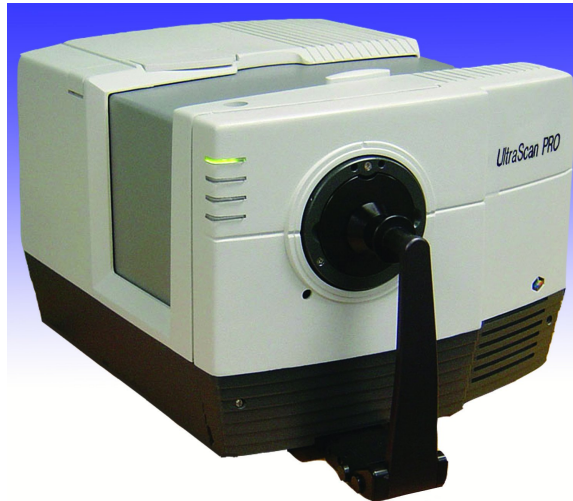
The UltraScan PRO

Of the many specifications frequently given for spectrophotometers, three relate to the ability of the instrument to accurately measure samples having steep slopes (quick changes) in their spectral reflectance or transmittance curves. They are effective bandwidth, wavelength resolution, and reporting interval. These specifications are discussed with respect to the UltraScan PRO in the sections below.