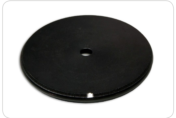
Figure 1. The Small Area View (SAV) or VSI options are required. Performance specifications will not be met with this smaller-than-standard port plate. The change of geometry with this option will cause a slight shift in the color values of the calibration standards.

For small quantities of powder, HunterLab has designed a special modified port plate for reflectance measurements of approximately 0.4 cc of packed powder. The sample is scooped into the powder holder and packed down with a plunger. The powder holder is then placed in a specially-designed port plate and the powder measured through the holder's clear window.