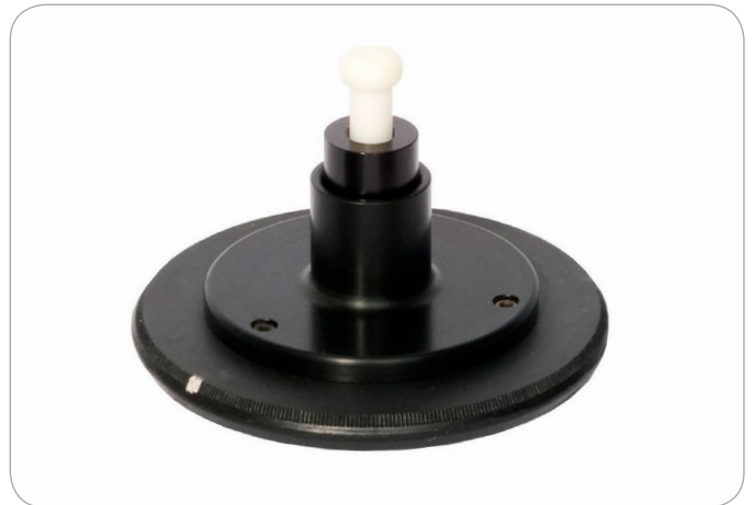
Figure 2. The powder holder should be used ONLY for color difference measurements.