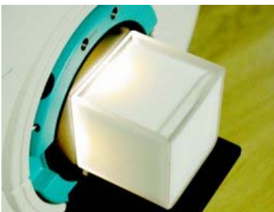
Translucent liquid on diffuse/8° instrument