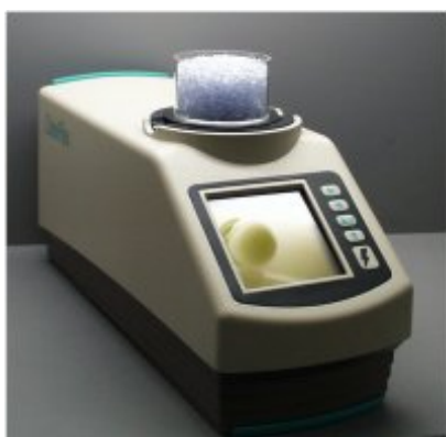
Cup of pellets on ColorFlex 45/0

Plastic pellets and similar items like rice and sugar must be measured in a batch rather than individually, which makes them more fluid than solid. They would either be placed in a glass sample cup and measured using a 45°/0° or 0°/45° instrument such as the LabScan XE, ColorFlex 45/0, or D25A (preferred) or placed in a glass transmission cell and measured at the reflectance port of a diffuse/8° instrument such as the ColorQuest XE, UltraScan PRO, or UltraScan VIS.