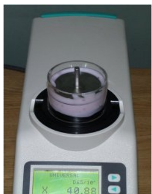
Semi-solid on ColorFlex 45/0

Translucent semi-solids, such as yogurt, baby food, and salad dressings, would either be placed in a glass sample cup and measured using a 45°/0° or 0°/45° instrument such as the LabScan XE, ColorFlex 45/0, or D25A (preferred) or placed in a glass transmission cell and measured at the reflectance port of a diffuse/8° instrument such as the ColorQuest XE, UltraScan PRO, or UltraScan VIS.