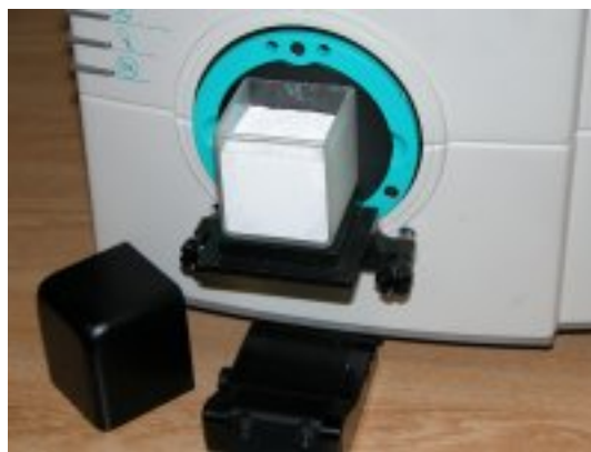
Cell of powder on diffuse/8° instrument