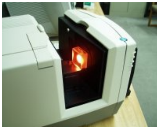
Transparent liquid in transmission

Transparent, translucent, and opaque liquids must all be placed in a container for measurement. Transparent samples would normally be placed in a glass transmission cell and measured in the transmission compartment of a diffuse/8° instrument such as the ColorQuest XE, ColorQuest XT, UltraScan PRO, or UltraScan VIS. Translucent and opaque liquids would either be placed in a glass sample cup and measured using a 45°/0° or 0°/45° instrument such as the LabScan XE, ColorFlex 45/0, or D25A (preferred) or placed in a glass transmission cell and measured at the reflectance port of a diffuse/8° instrument such as the ColorQuest XE, UltraScan PRO, or UltraScan VIS.