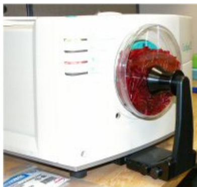
Large particulates in Petri dish on diffuse/8° instrument