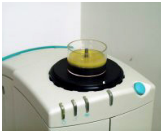
Translucent liquid on LabScan XE