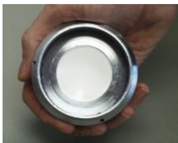
Powder plaque ready for measurement

While powders are technically solids, like liquids they would damage your instrument if not contained or made even more solid. Powders may be pressed smooth into a plaque and measured using a 45°/0° or 0°/45° instrument such as the LabScan XE or D25A in the port-down orientation or they may be placed in a glass sample cup and measured using a 45°/0° or 0°/45° instrument such as the LabScan XE, ColorFlex 45/0, or D25A in the port-up orientation. Less preferred, but still possible, is measuring powder in a glass transmission cell at the reflectance port of a diffuse/8° instrument such as the ColorQuest XE, UltraScan PRO, or UltraScan VIS.