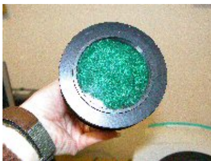
Compressed fibers ready for measurement

Like powders, textile fibers are technically solids. However, a transparent layer must be provided between the fibers and the sample port to keep the textile fibers in the proper place relative to the instrument optics, rather than having them enter the sample port. Normally, textile fibers are flattened to the bottom of a sample cup using the compression cell set available for the ColorQuest XE, LabScan XE, UltraScan PRO, and UltraScan VIS.