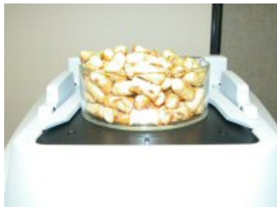
Large particulates in sample dish on the D25LT