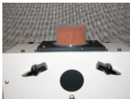
Cup of powder on D25A