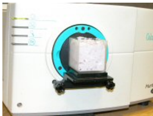
Semi-solid on diffuse/8° instrument