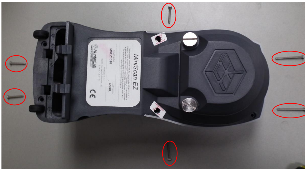
Figure 1. Remove Screws from MSEZ Cover.